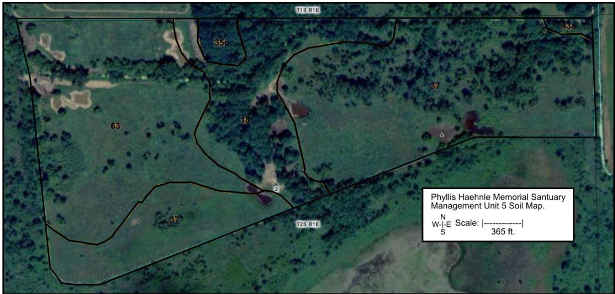
Figure 1. Unit 5 soil map.