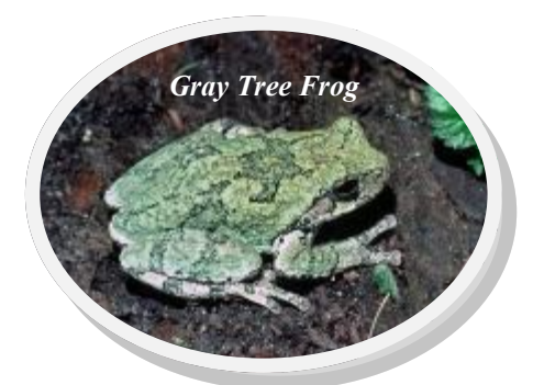
Click Here To Listen www.youtube.com/watch?v=2kd5c4p8-0M