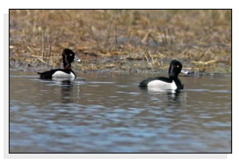
Ring-necked Ducks on Portage River

This would not have been possible without the generous gift of 170 acres by Judy Cory in 1986, and for a grant from Ducks Unlimited to purchase 14 acres from other owners in 2001. Drainage ditches were plugged, drain tile broken, shallow ponds dug, and water control structures installed as part of restoration efforts. Later in partnership with a watershed stream bank improvement program, native trees and shrubs were planted along the trail.