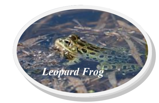
Click Here To Listen www.youtube.com/watch?v=kUdeEw2BPsQ,