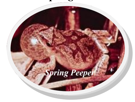
Click Here To Listen <a href="http://www.youtube.com/watch?v=ZX9uODHi0zg">http://www.youtube.com/watch?v=ZX9uODHi0zg</a>,