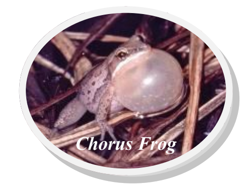
Click Here To Listen <a href="http://www.youtube.com/watch?v=x171BHpft_l">http://www.youtube.com/watch?v=x171BHpft_l</a>,