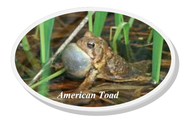
Click Here To Listen http://www.youtube.com/watch?v=A6-8pC8o5fw,

(You need to connect to the internet to hear these sounds.)