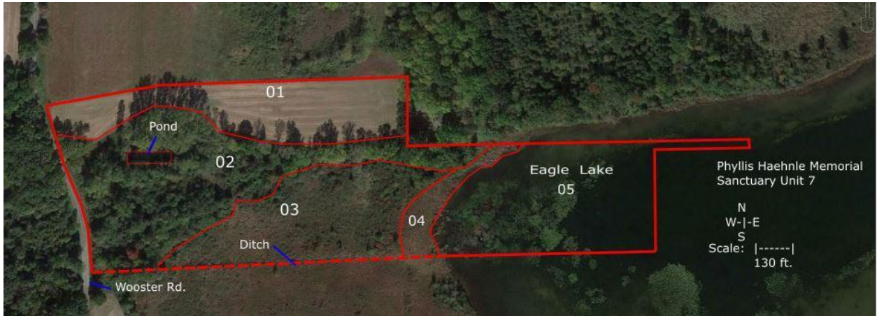
Figure 1. Unit 7 management units map.